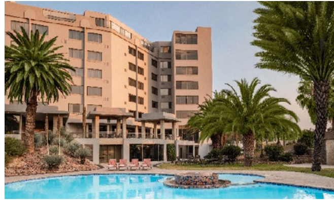
Mövenpick Hotel Windhoek 8-minute drive (5 km) to the conference venue