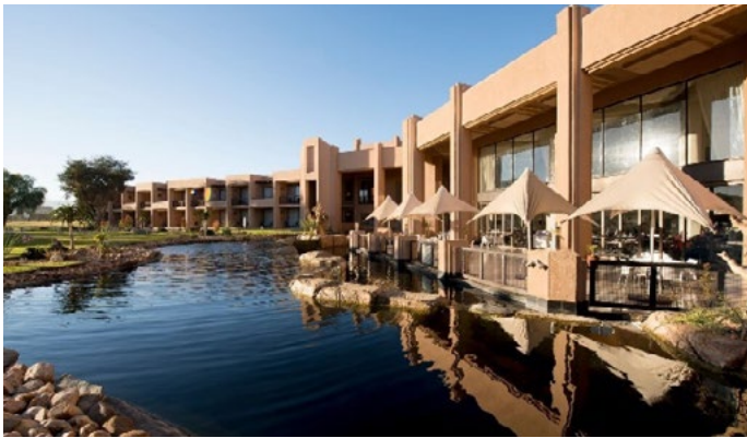
Windhoek Country Club & Resort Conference venue (48.2 km) from Hosea Kutako International Airport