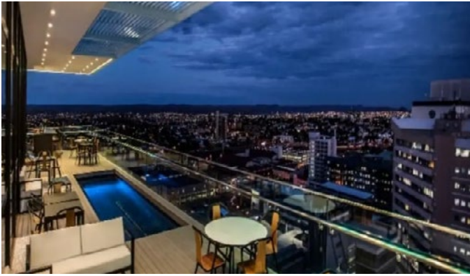
Avani Hotel Windhoek 12-minute drive (8 km) to the conference venue